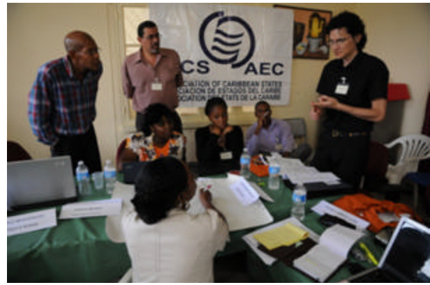
QMS training at CIMH in Barbados 9-13 May 2011

To coordinate SHOCS with similar initiatives in the region, members of the Project Board include representation from regional organizations: Caribbean Disaster Emergency Management Agency (CDEMA), Caribbean Meteorological Organization (CMO) and World Meteorological Organization (WMO).