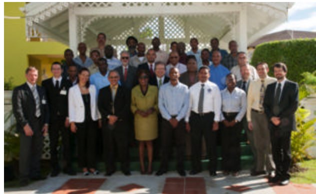
Participants of the QMS workshop, Rodney Bay Saint Lucia 5-9 Dec 2011

The second phase of SHOCS is scheduled for implementation in 2013 - 2014 with a budget of approximately 1 Million EUR. It is planned to form a seamless continuation of capacity building activities, started during the first phase, with the aim to implement systems involving investments on capacity development, meteorological observation instruments, and methods, including hardware and software, for forecasting and communication of severe weather. Preparation of SHOCS II is currently underway to arrive with a set of activities that would best complement the on-going work in the region.